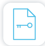
File Access Manager